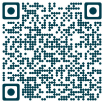
Scan to Apply for CareCredit

LASIK is an investment that pays off in many ways. At Vance Thompson Vision, we walk you through opportunities for laser vision correction to be the best investment you make. One payment option is to take advantage of your tax-free flexible savings account (FSA) or health savings account (HSA). Both funds are built on pre-tax dollars, saving you money right away. Now is the time to start planning to take advantage of tax benefits. With additional no-interest financing options, provided through CareCredit, you might find that LASIK is more affordable than you think. Schedule your complimentary LASIK screening. We will meet with you to talk about your vision AND your budget.